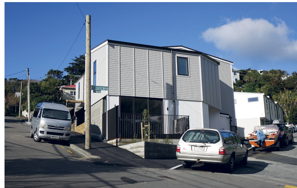
The top photo shows the former St Bernard's Church on Taft Street which was demolished in May 2025 to make way for a new townhouse development.