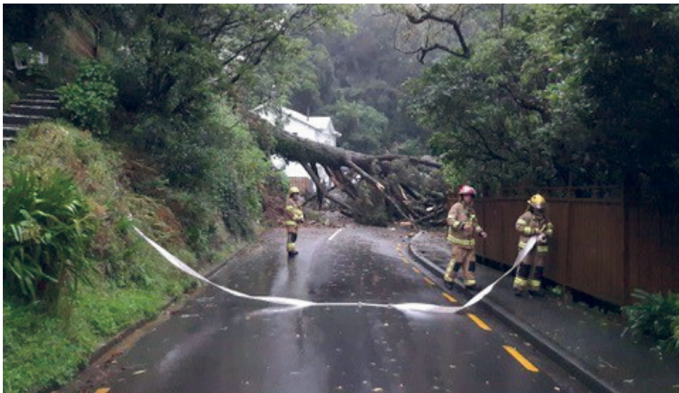
Laura Avenue, Brooklyn