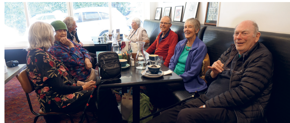
Penthouse Cinema Café catchup with our Friday Circle Seniors Group during the April School Holidays