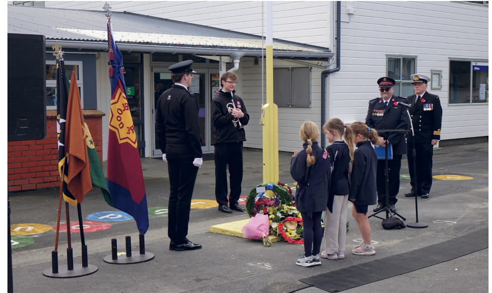
At Brooklyn School, Washington Avenue