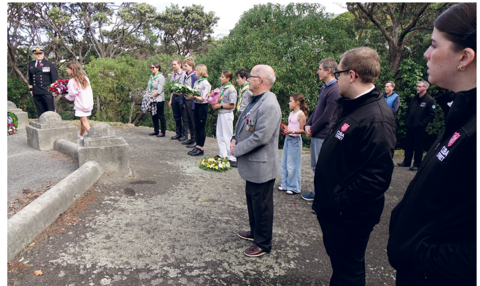
At Brooklyn War Memorial, Sugarloaf Hill