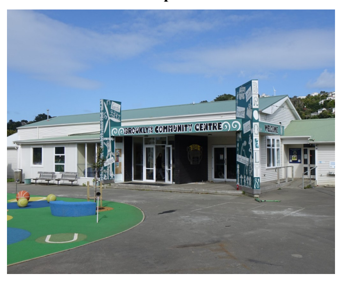
Brooklyn Community Centre 18 Harrison Street